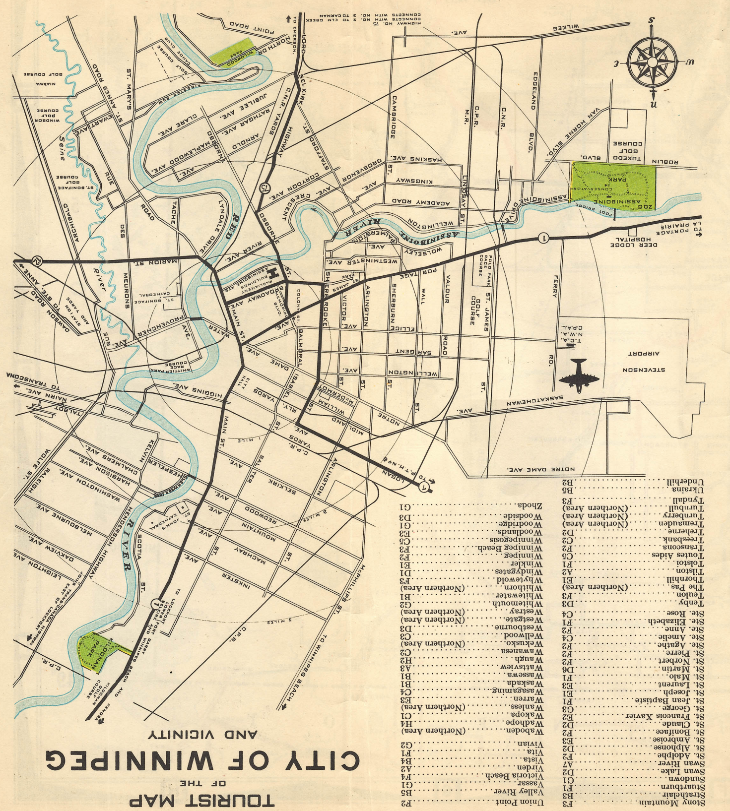
CITY OF WINNIPEG AND VICINITY TOURIST MAP