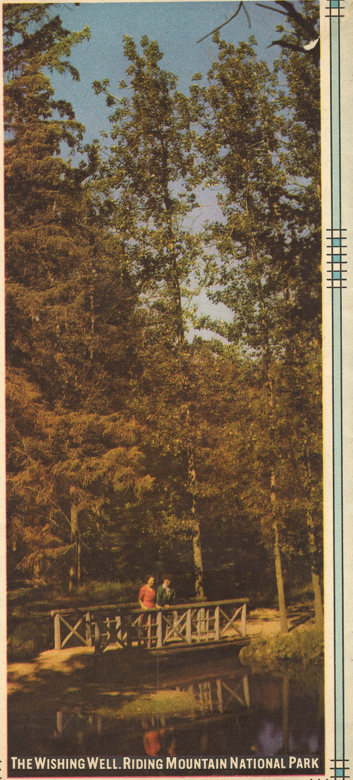
THE WISHING WELL RIDING MOUNTAIN NATIONAL PARK