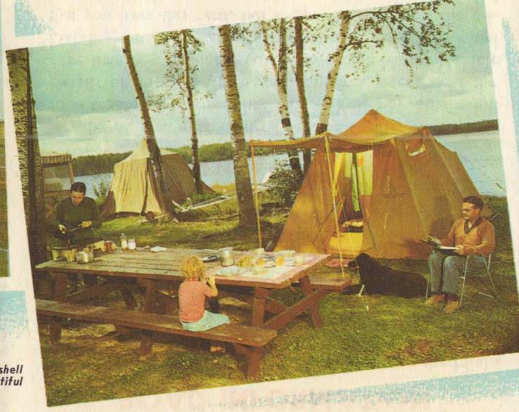
A picturesque camp site in the Whiteshell Forest Reserve, typical of many beautiful camping areas in the province.

WINNIPEG Horse Racing, the exciting Sport of Kings at Assiniboia Downs. Red River Exhibition, industrial showcase and carnival attractions. Highland Games, reels, pipers and athletic events of Scotland. Lower Fort Garry, only stone fur trade post still intact in North America. Assiniboine Park, beautiful gardens, picnic sites, zoo and conservatory. Ross House and Countess of Dufferin, first Post Office and locomotive in Western Canada. Seven Oaks House and Museum, oldest private home in Manitoba. Upper Fort Garry Gate, all that remains of the historic fort. La Verendrye Monument, honors pioneer explorer of Western Canada. St. Boniface Basilica, immortalized in Whittier's poem "The Red River Voyageur". Manitoba Museum and Art Gallery, where mementos and relics of the old west are on display. Legislative Building, one of the continent's most beautiful public buildings.