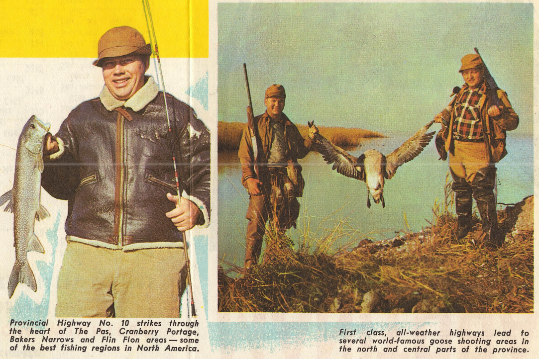
Provincial Highway No. 10 strikes through the heart of The Pas, Cranberry Portage, Bakers Narrows and Flin Flon areas—some of the best fishing regions in North America.

NORTHERN MANITOBA Fort Prince of Wales and Arctic Museum at Churchill. Flin Flon Trout Festival—fishing contests and carnival attractions. Trappers' Festival at The Pas—winter sports and contests. Northwest Roddeo, Swan River, Manitoba's version of the Calgary Stampede. Henry Kelsey Cairn, Sir John Franklin Sun Dial, historic Christ Church at The Pas. Hudson's Bay Mining & Smelting Co. operations at Flin Flon. Bakers Narrows and Cranberry Portage, fabulous fishing areas north of The Pas. Cormorant Forest Reserve and The Pas District, superb fishing, hunting and waterfowl shooting. Pasqua, reclamation and agricultural development at The Pas.