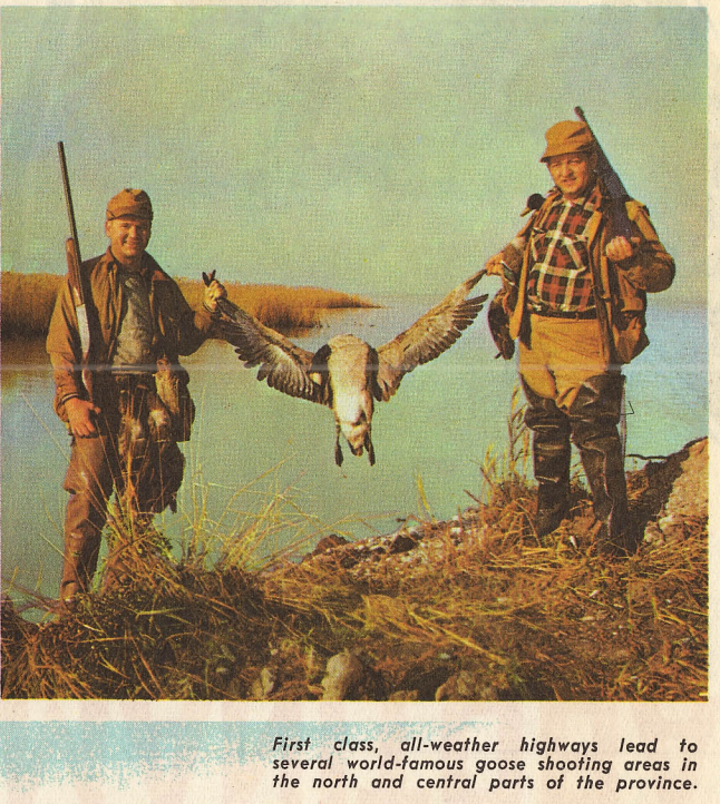
First class, all-weather highways lead to several world-famous goose shooting areas in the north and central parts of the province.