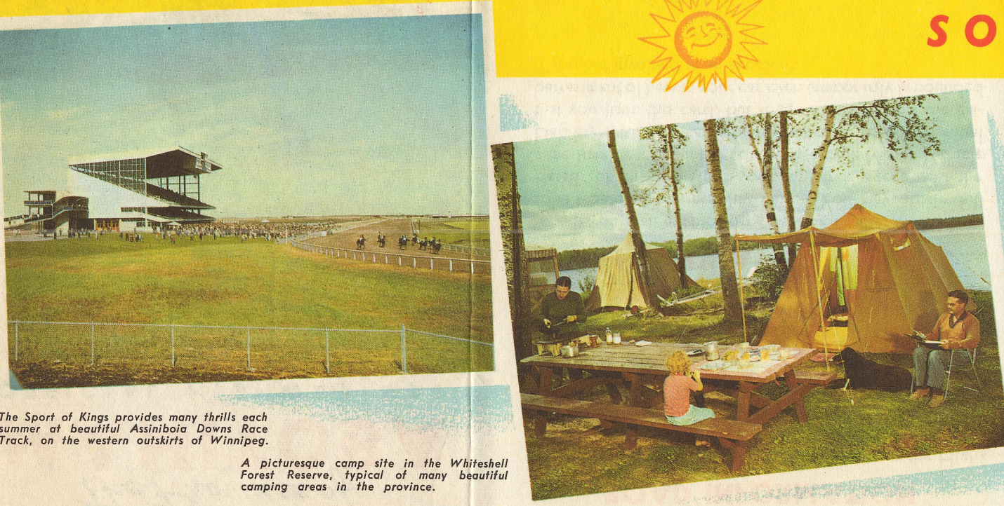
The Sport of Kings provides many thrills each summer at beautiful Assiniboia Downs Race Track, on the western outskirts of Winnipeg.