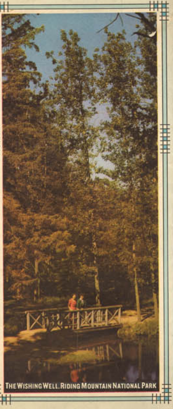
THE WISHING WELL RIDING MOUNTAIN NATIONAL PARK