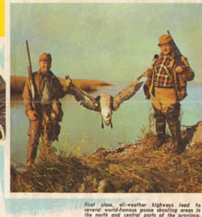
First class, all-weather Highways lead to several world-famous goose shooting areas in the north and central parts of the province.