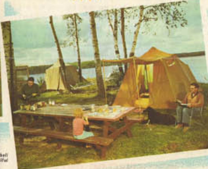
A picturesque camp site in the Whiteshell Forest Reserve, typical of many beautiful camping areas in the province.