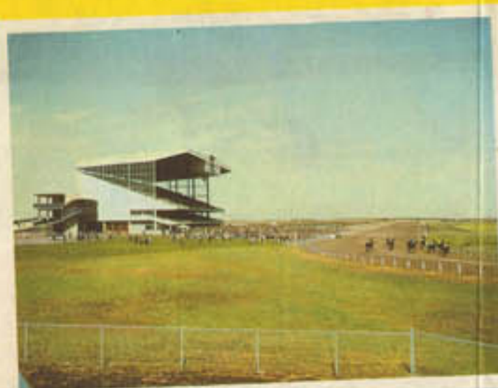
The Sport of Kings provides many thrills each summer at beautiful Assiniboia Downs Race Track, on the western outskirts of Winnipeg.