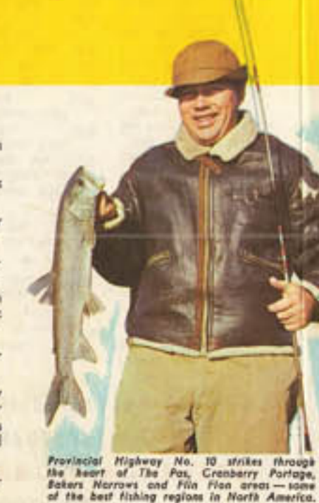
Provincial Highway No. 20 strikes through the heart of The Pas, Cranberry Portage, Bakes Narrows and Flin Flon areas—some of the best fishing regions in North America.

Fort Prince of Wales and Arctic Museum at Churchill. Flin Flon Trout Festival—fishing contests and carnival attractions. Trappens Festival at The Pas—winter sports and contests. Northwest Rodeo, Swan River, Manitoba's version of the Calgary Stampede. Henry Kelsey Cairn, Sir John Franklin Sun Dial, historic Christ Church at The Pas. Hudson's Bay Mining & Smelting Co. operations at Flin Flon. Bakes Narrows and Cranberry Portage, fabulous fishing areas north of The Pas. Comox Forest Reserve and The Pas District, superb fishing, hunting and waterfowl shooting. Pasqua, reclamation and agricultural development at The Pas.