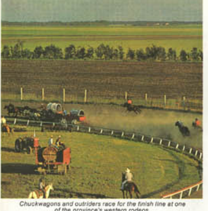
Chuckwagons and outsiders race for the finish line at one of the province's western rodeos.