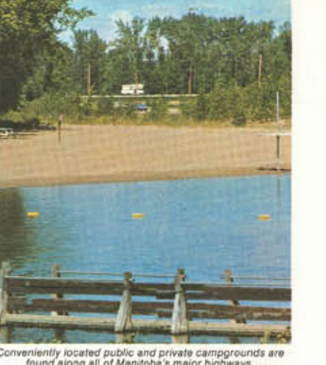
Conveniently located public and private campgrounds are found along all of Manitoba's major highways.