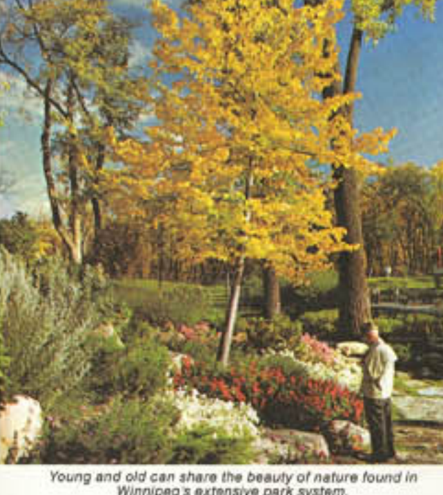
Young and old can share the beauty of nature found in Winnipeg's extensive park system.