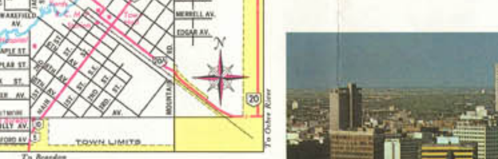
Manitoba's Legislative Building sits in the heart of Winnipeg, the province's capital city.

The Friendly Province in Canada's Mid-West