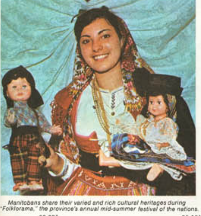
Manitobans share their varied and rich cultural heritages during 'Folklorama', the province's annual mid-summer festival of the nations.