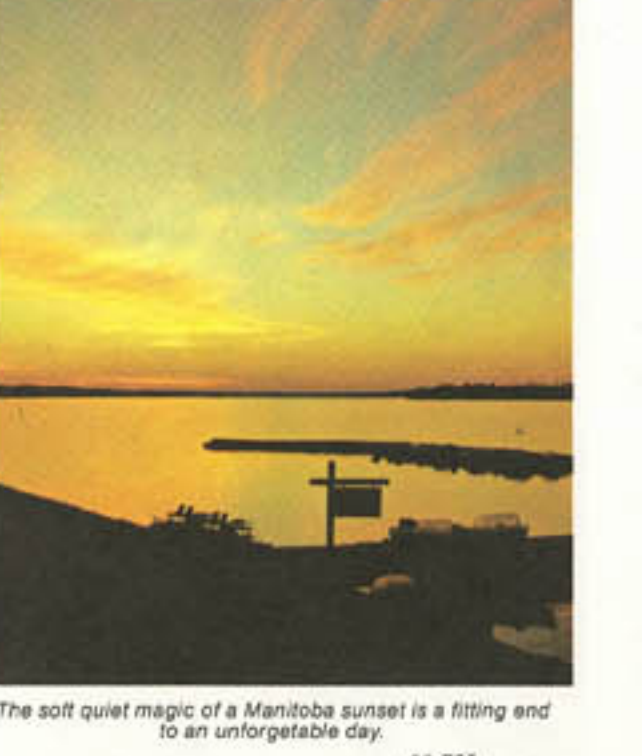
The soft quiet magic of a Manitoba sunset is a fitting and unforgettable day.