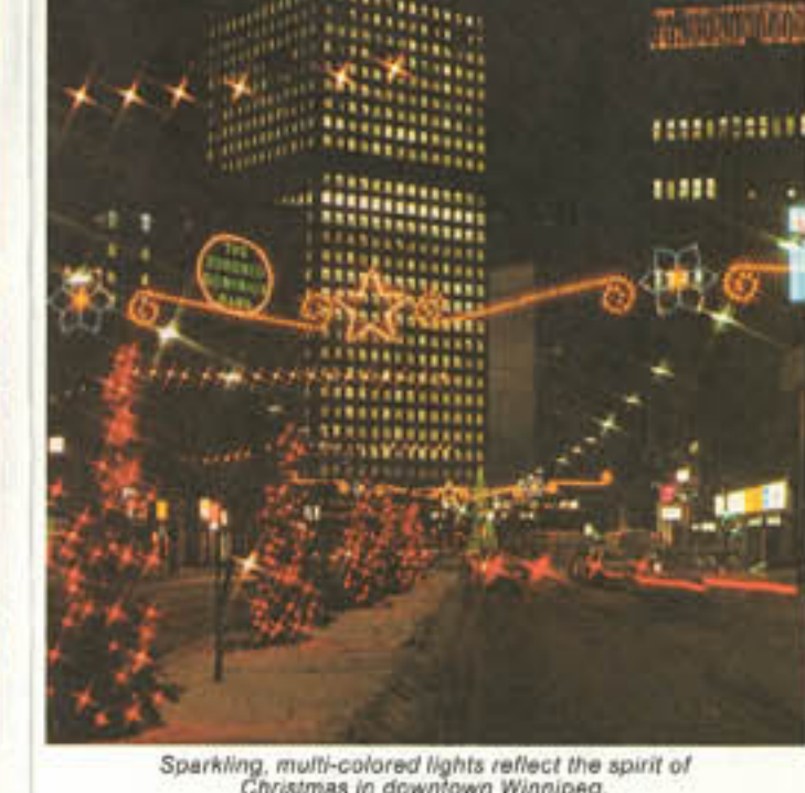
Sparkling, multi-colored lights reflect the spirit of Christmas in downtown Winnipeg.